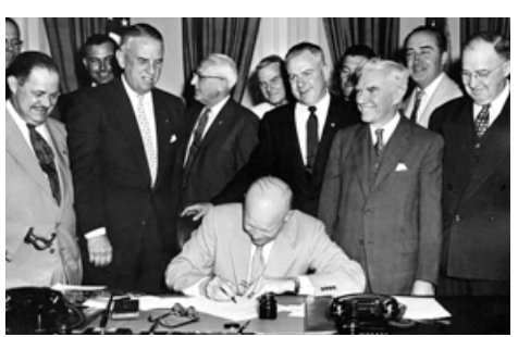
President Eisenhower signing HR7786, changing Armistice Day to Veterans Day